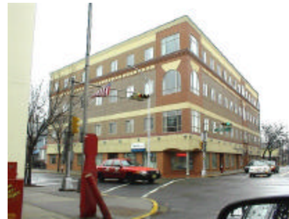
Our new location is at the Trinitas Building in downtown Elizabeth. Prenatal care and WIC also have offices in the building so we are able to make good referrals.